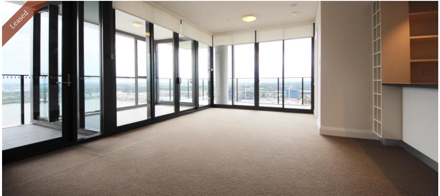
Unit 2309, 42 Walker St, Rhodes