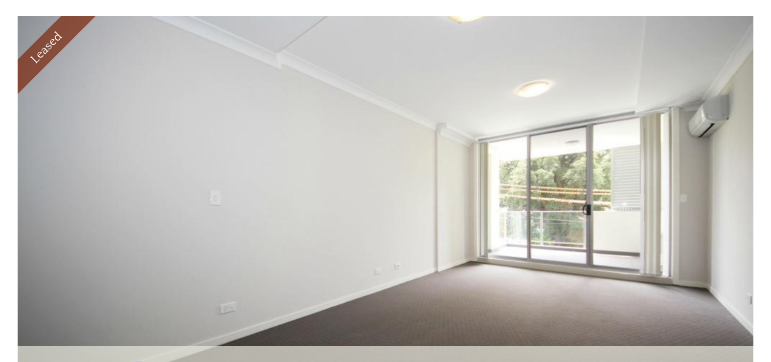
17, 9-15 Balmoral Street, Waitara