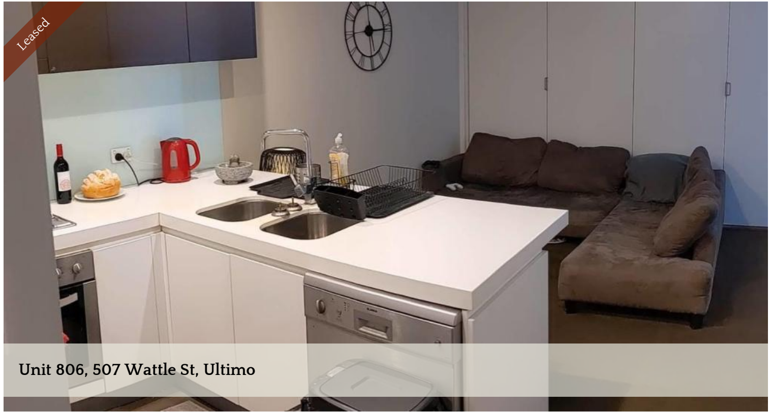
Unit 806, 507 Wattle St, Ultimo