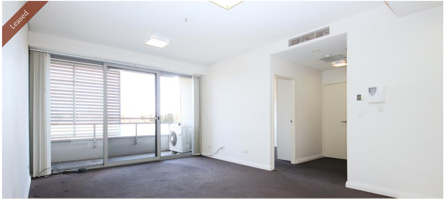
C407, 1-17 Elsie Street, Burwood