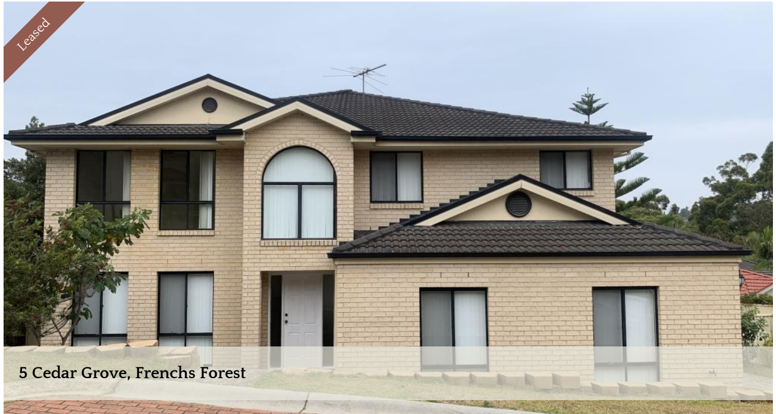
5 Cedar Grove, Frenchs Forest