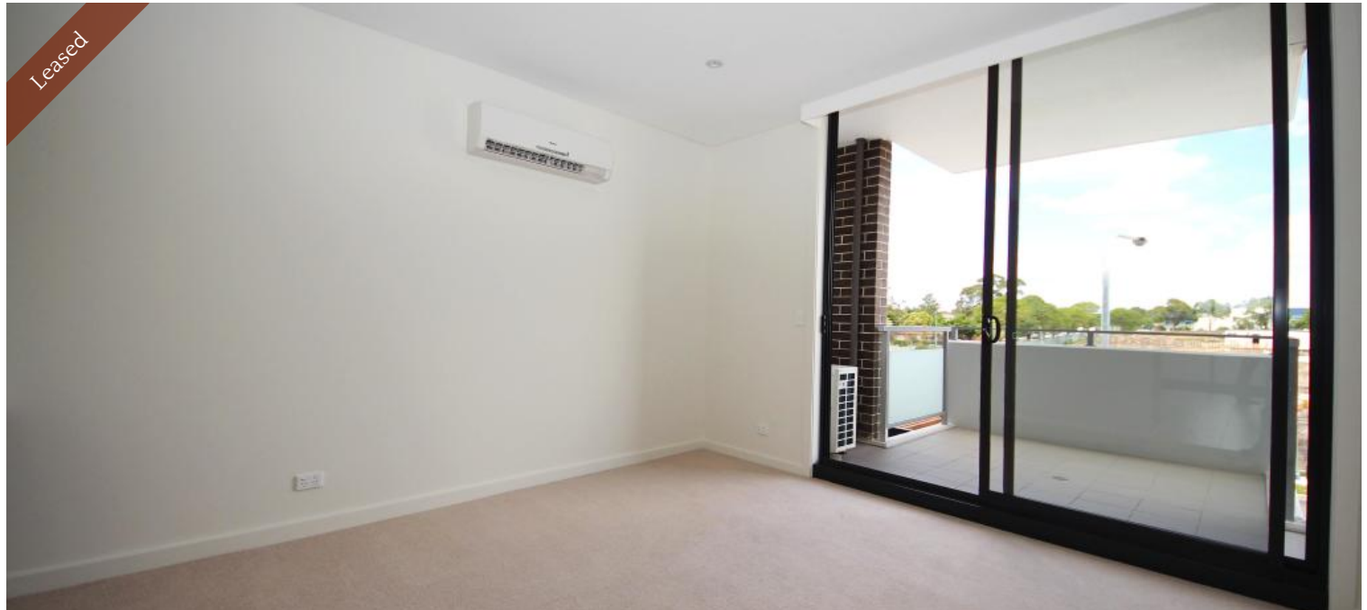
Unit 3, 14 Victa St, Campsie