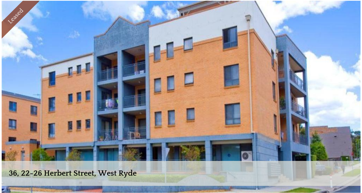
36, 22-26 Herbert Street, West Ryde