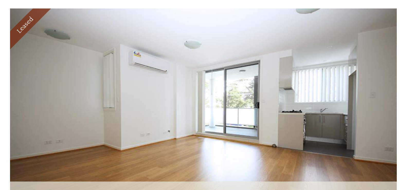
53, 16-20 Park Avenue, Waitara