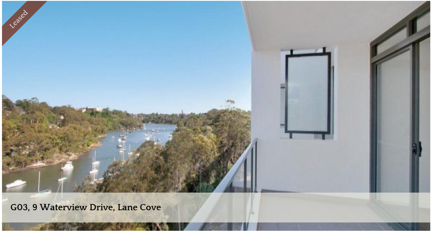
G03, 9 Waterview Drive, Lane Cove