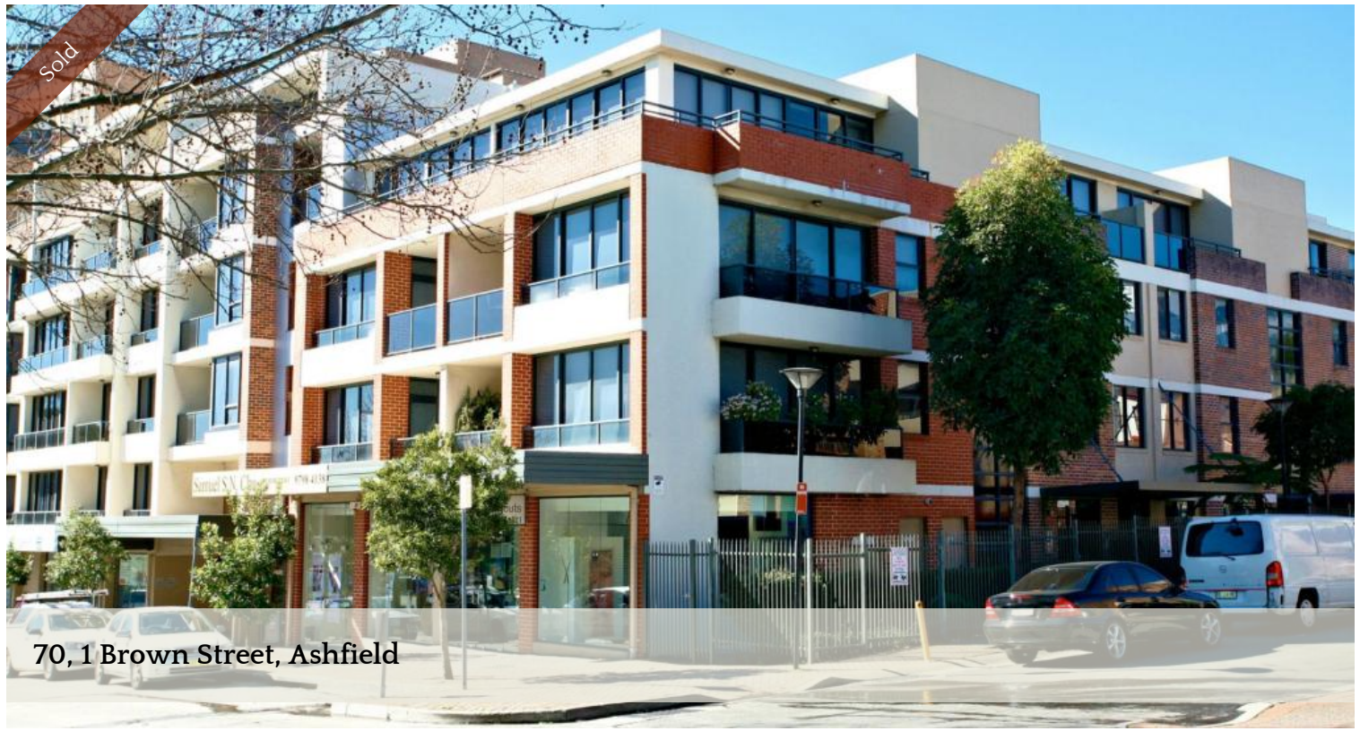
70, 1 Brown Street, Ashfield