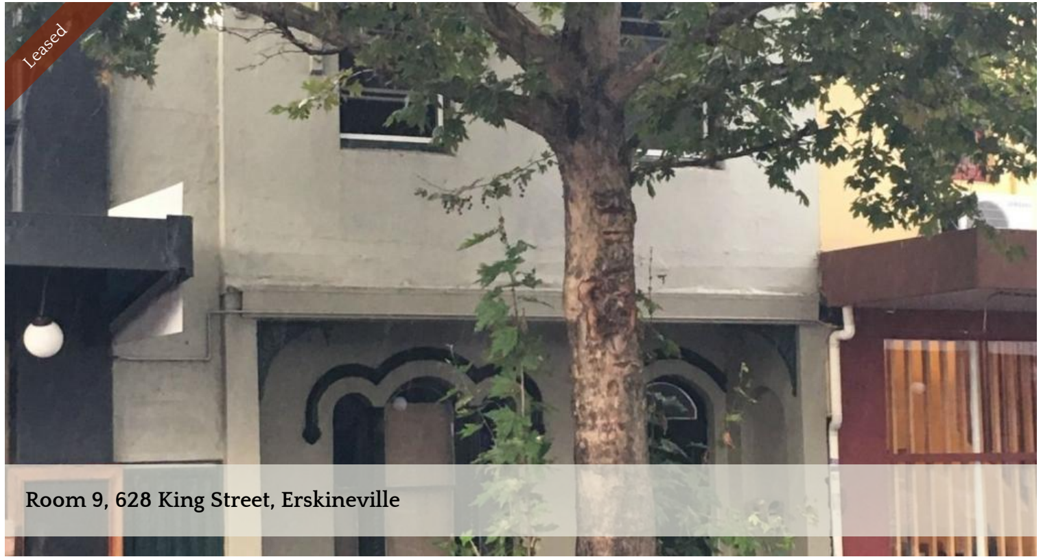
Room 9, 628 King Street, Erskineville