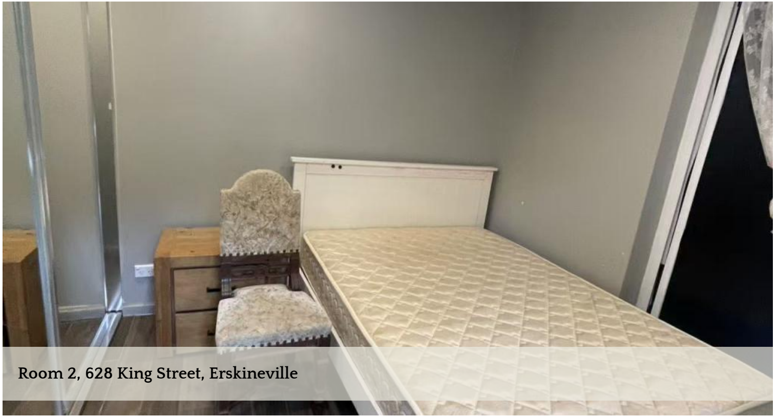
Room 2, 628 King Street, Erskineville