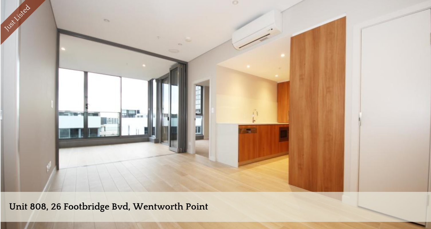
Unit 808, 26 Footbridge Bvd, Wentworth Point