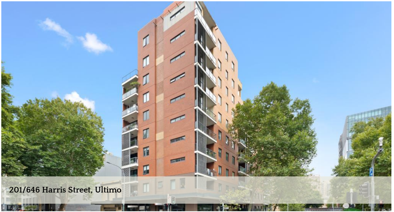
201/646 Harris Street, Ultimo