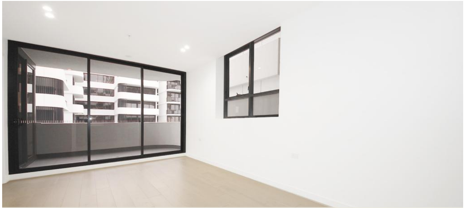
Unit 416/15 Jack Brabham Dr, Hurstville