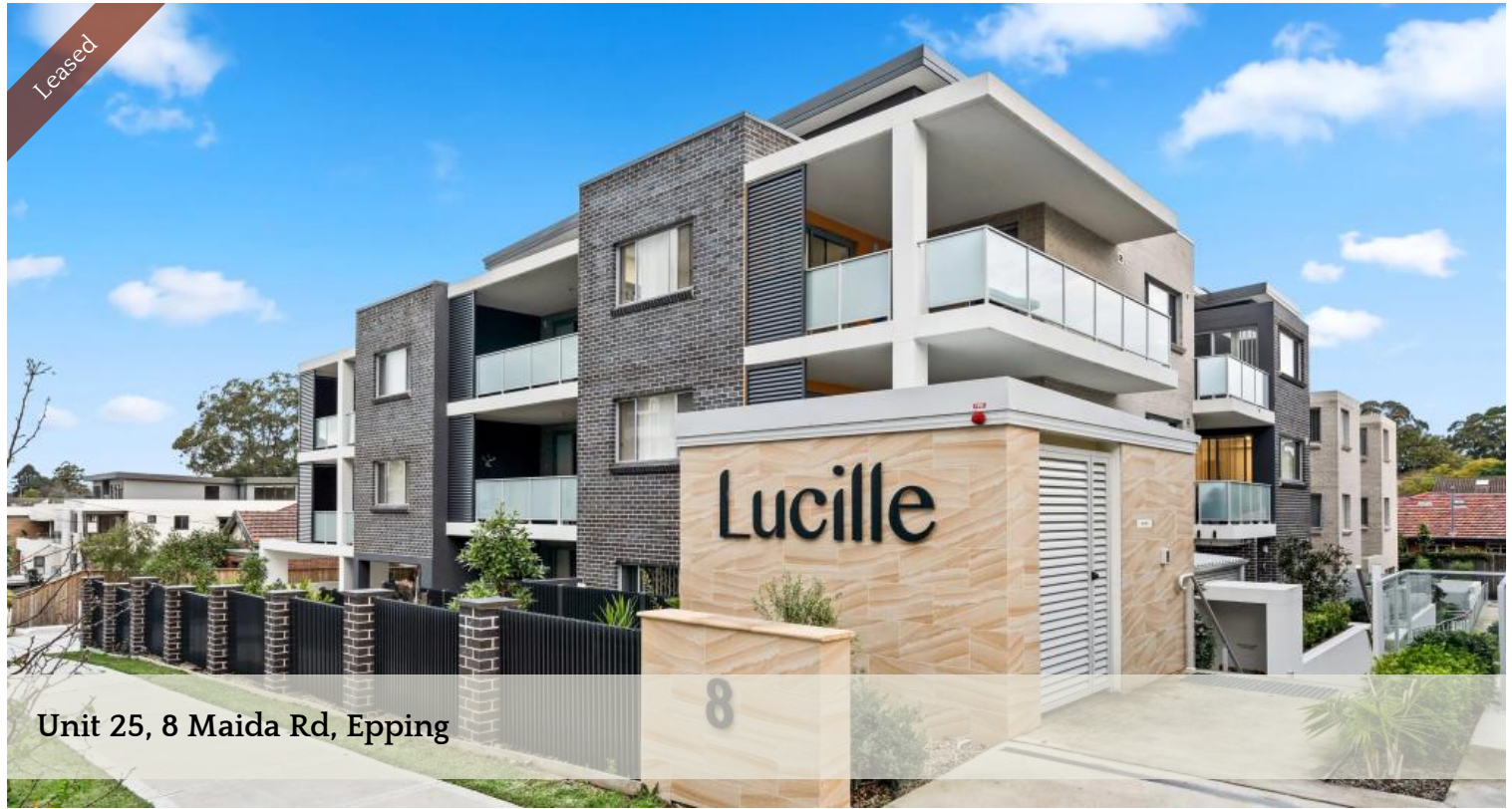
Unit 25, 8 Maida Rd, Epping