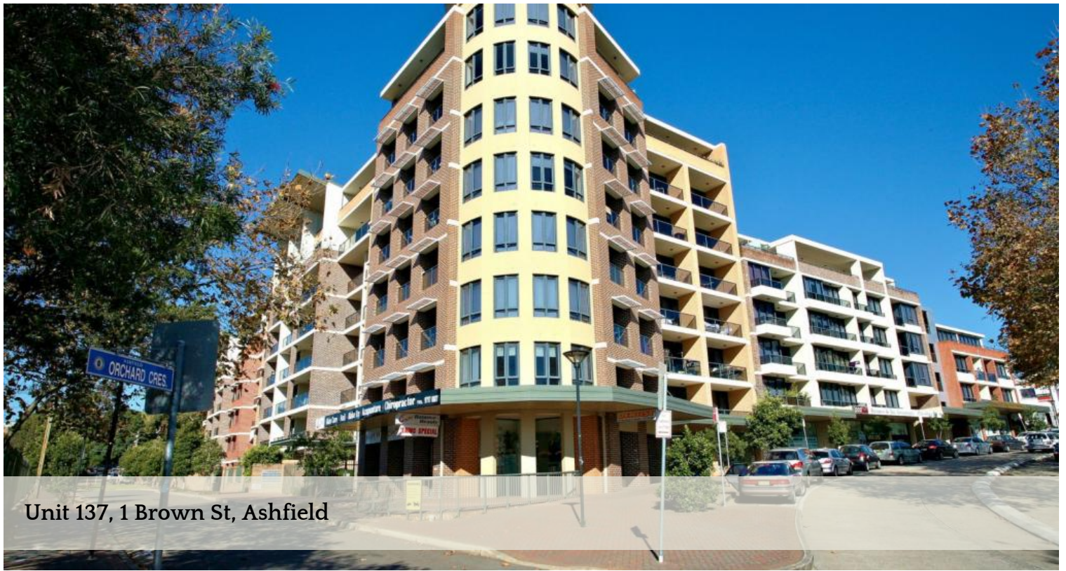
Unit 137, 1 Brown St, Ashfield