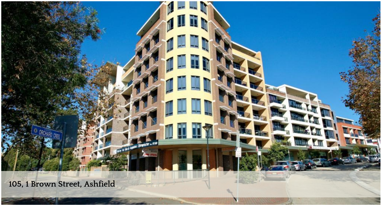
105, 1 Brown Street, Ashfield