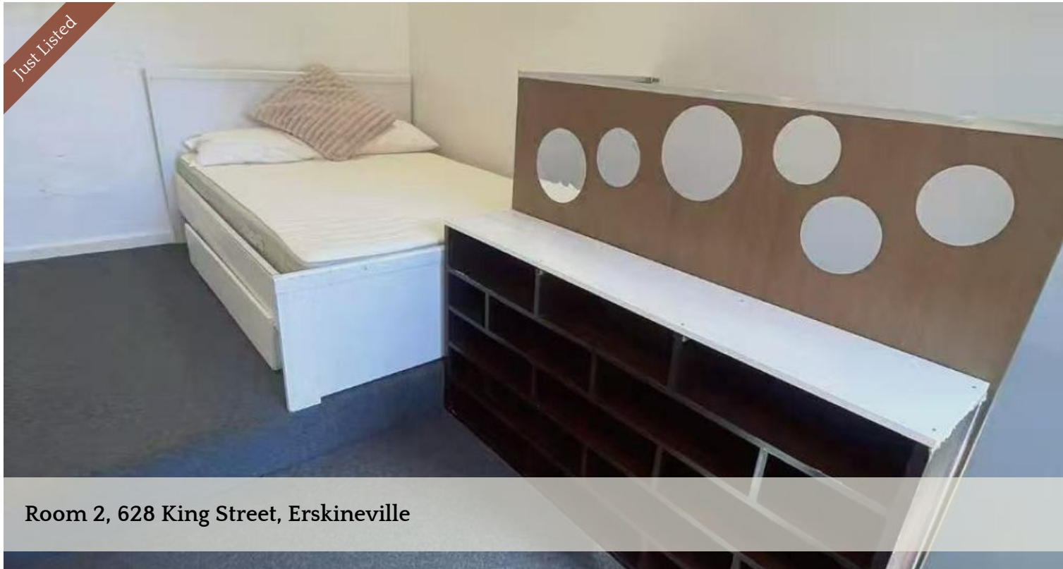
Room 2, 628 King Street, Erskineville