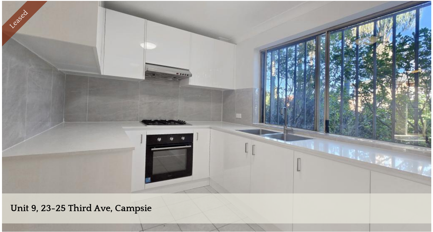
Unit 9, 23-25 Third Ave, Campsie