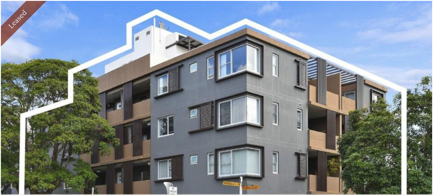
G03, 12-14 Mandemar Ave, Homebush West