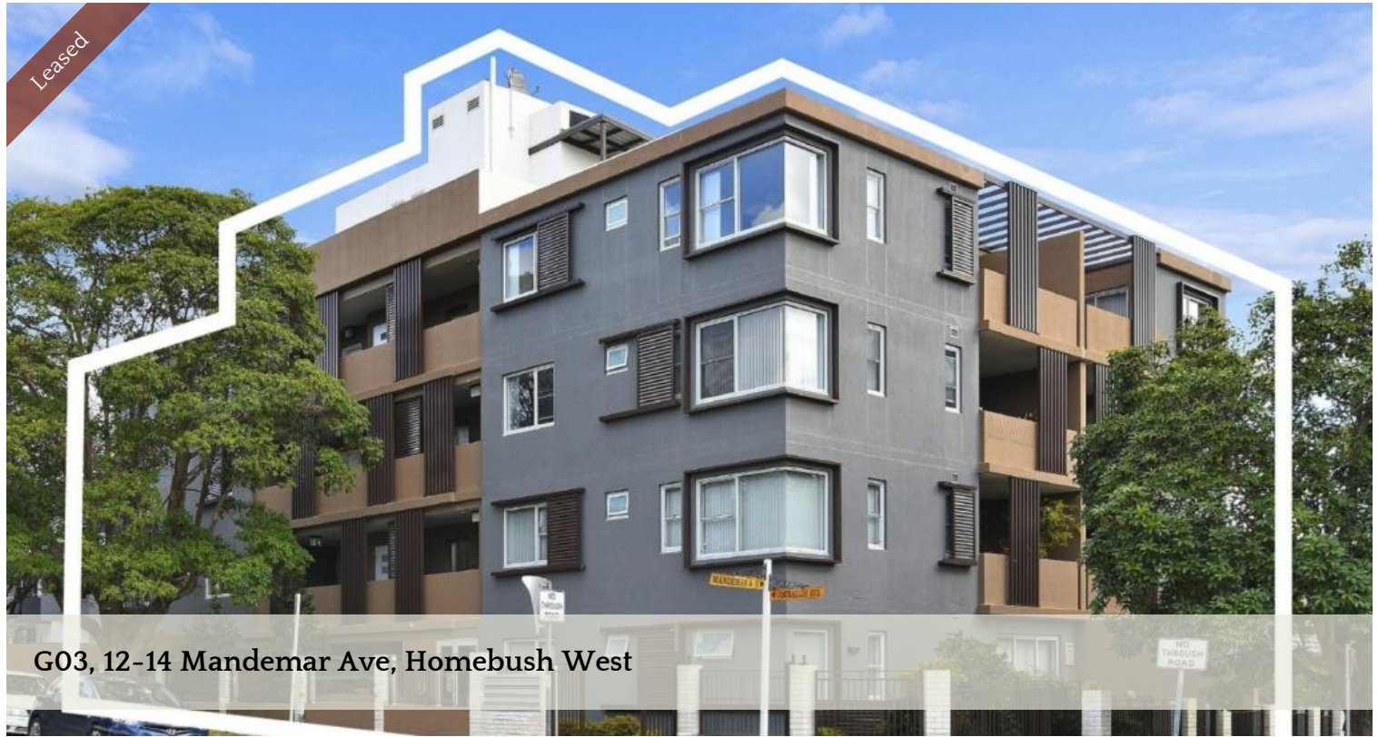
G03, 12-14 Mandemar Ave, Homebush West