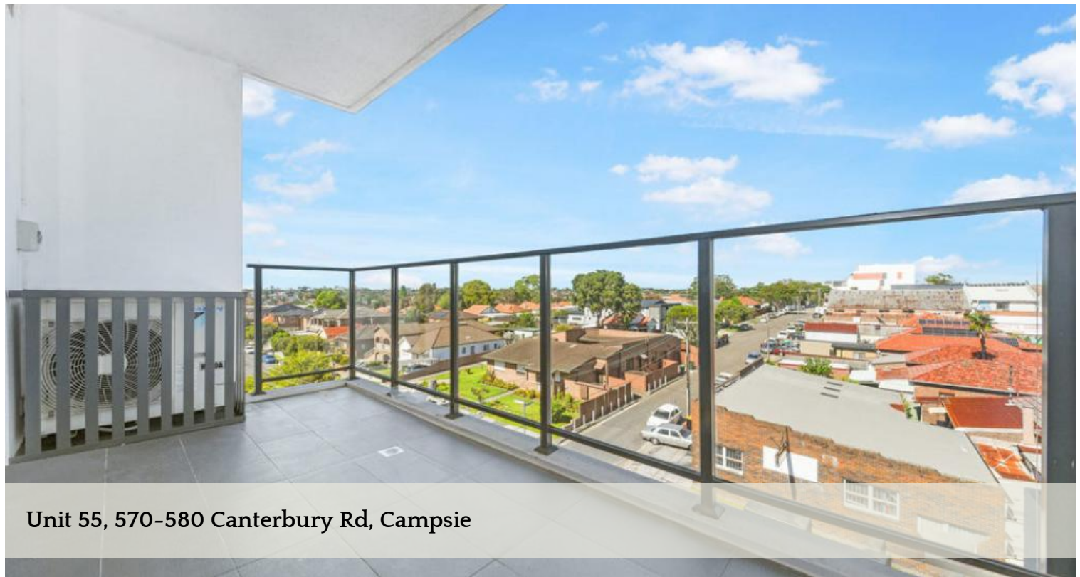
Unit 55, 570-580 Canterbury Rd, Campsie