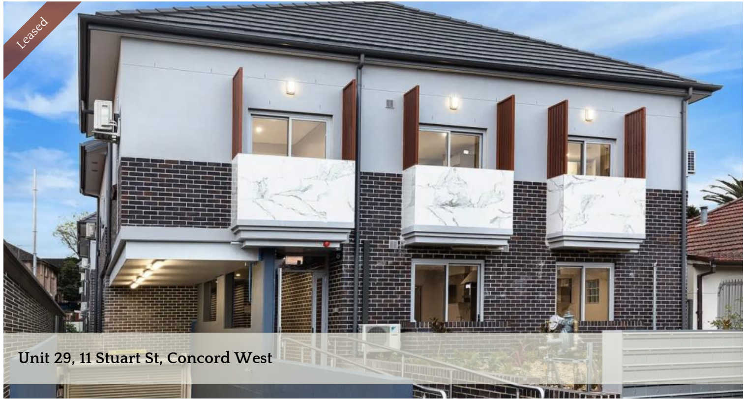
Unit 29, 11 Stuart St, Concord West