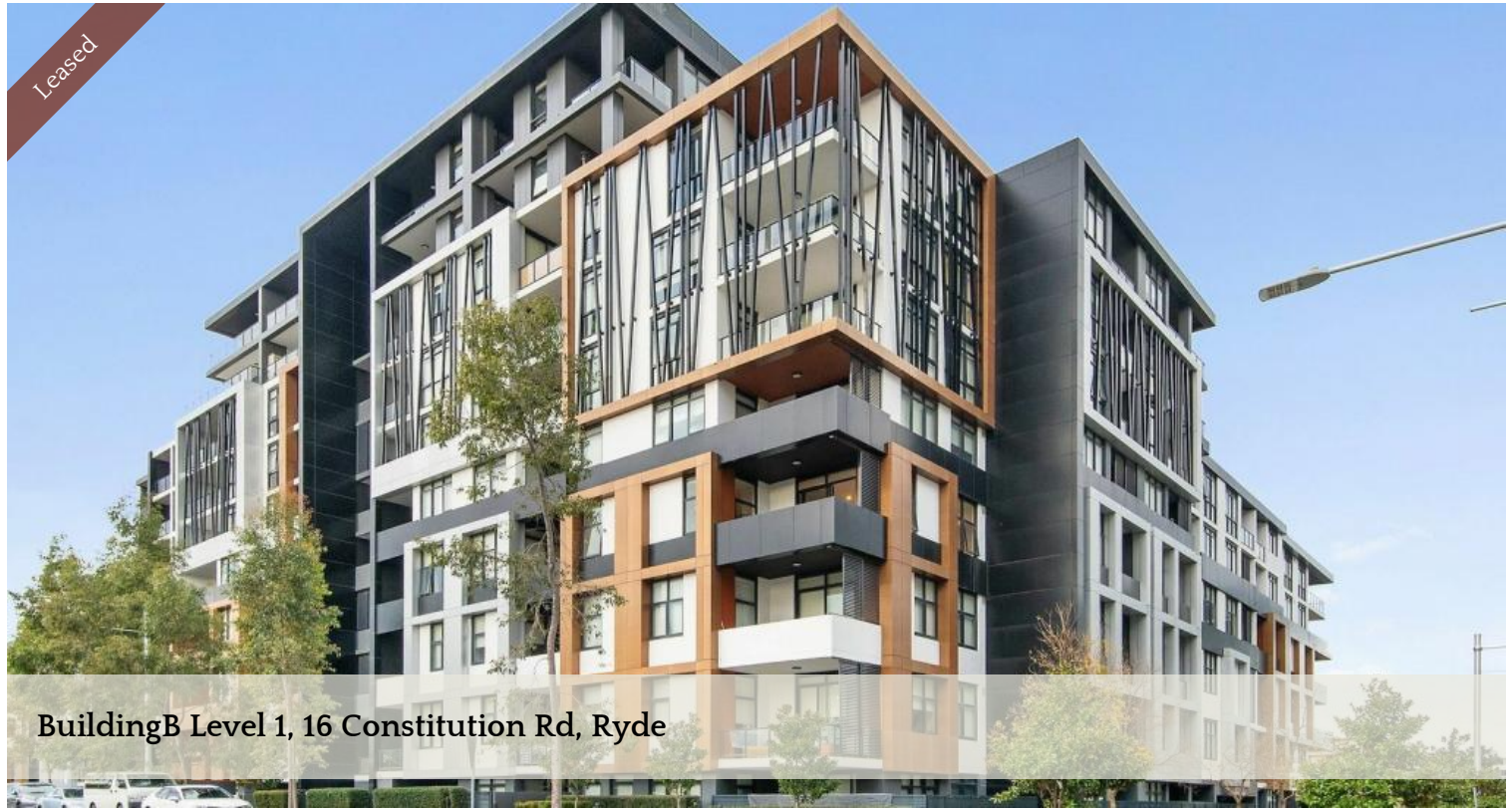
BuildingB Level 1, 16 Constitution Rd, Ryde