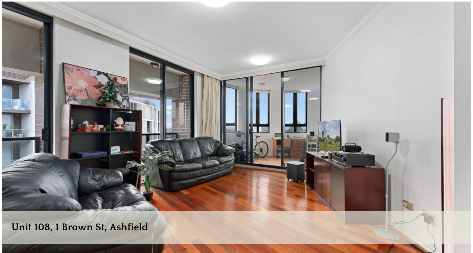
Unit 108, 1 Brown St, Ashfield