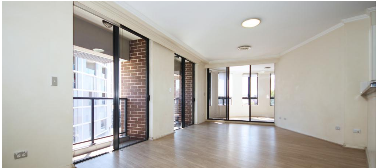
1, Brown St, Ashfield