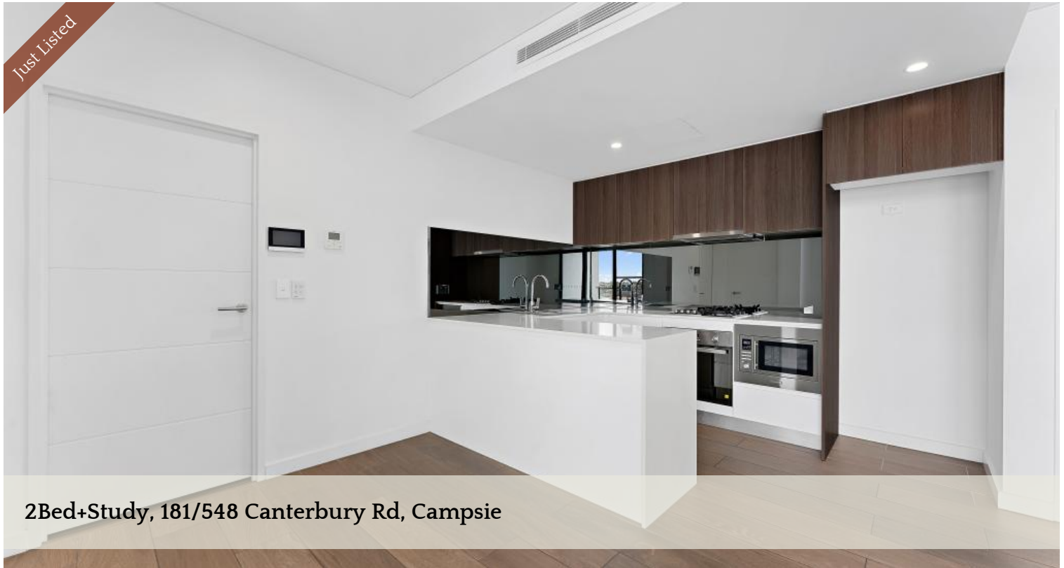
2Bed+Study, 181/548 Canterbury Rd, Campsie