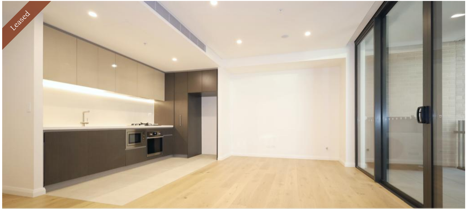
Level 3, 25 Ashford Avenue, Castle Hill