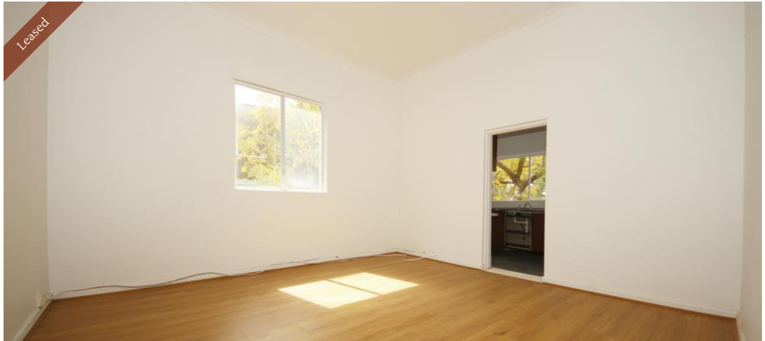
Unit 3, 16A Tintern Rd, Ashfield