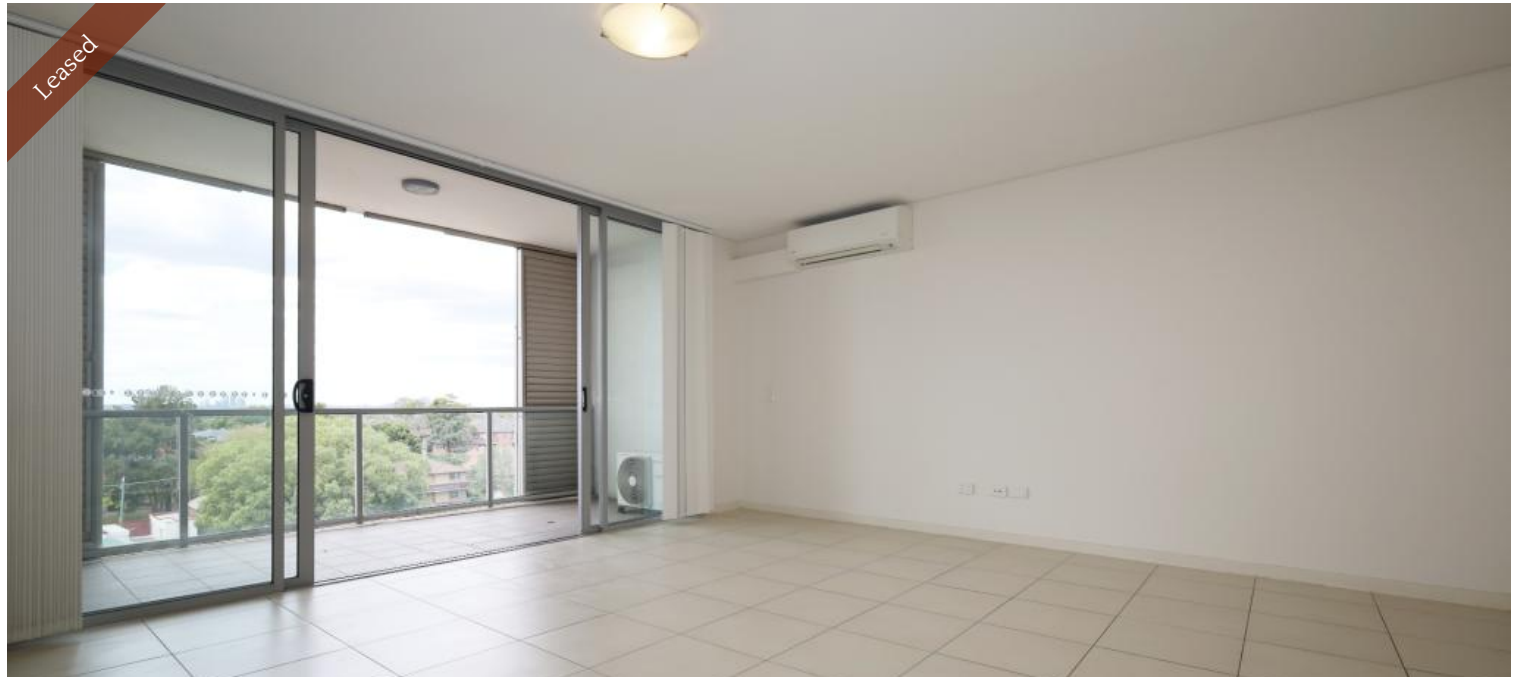
Unit 51, 2A Brown St, Ashfield