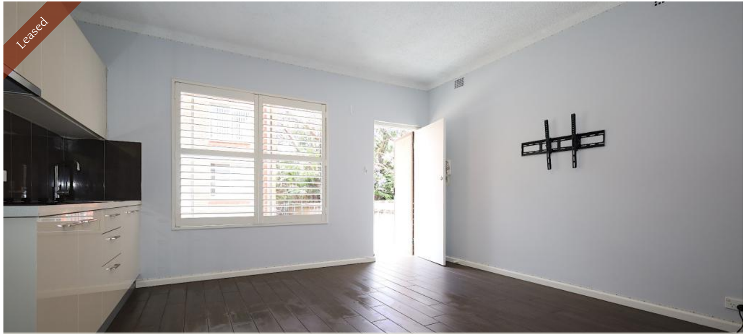
Unit 1, 37B Herbert St, Summer Hill