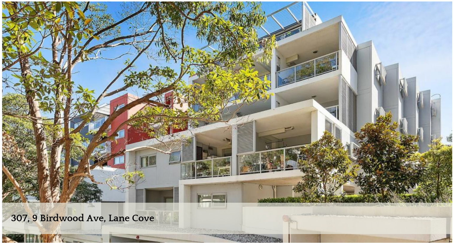
307, 9 Birdwood Ave, Lane Cove