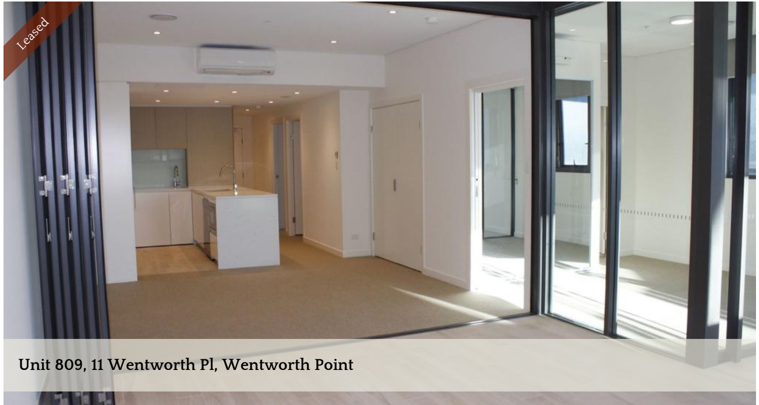
Unit 809, 11 Wentworth Pl, Wentworth Point