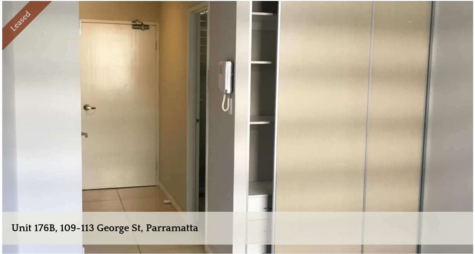
Unit 176B, 109-113 George St, Parramatta