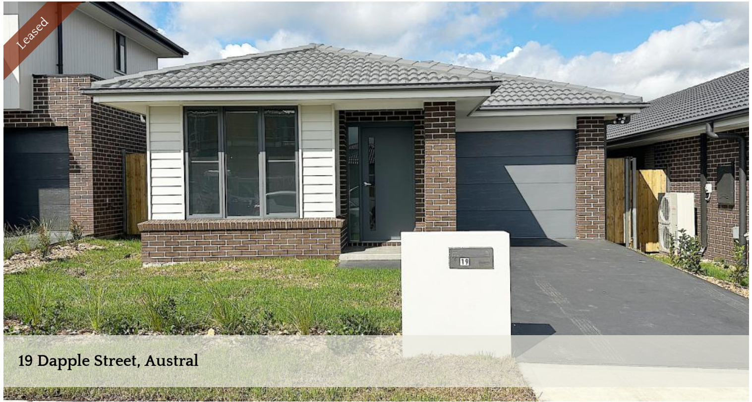
19 Dapple Street, Austral