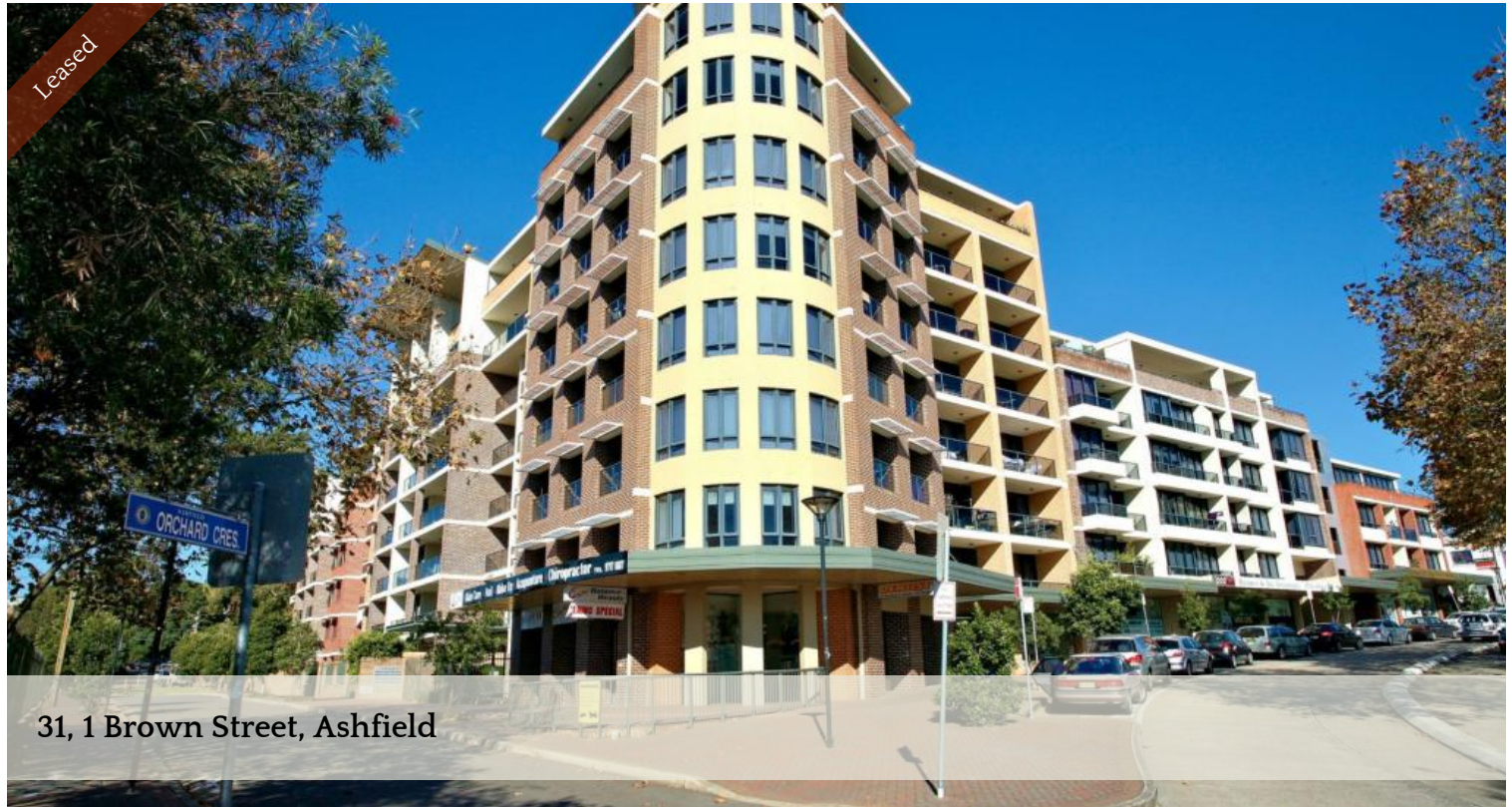
31, 1 Brown Street, Ashfield