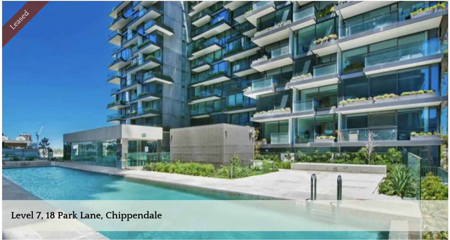
Level 7, 18 Park Lane, Chippendale