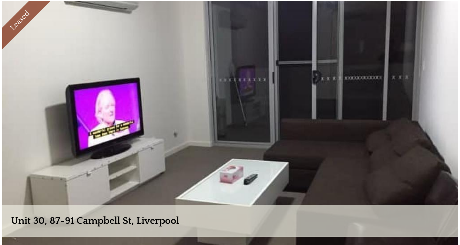
Unit 30, 87-91 Campbell St, Liverpool