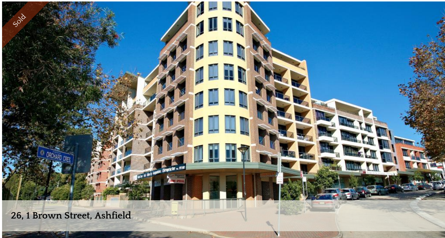
26, 1 Brown Street, Ashfield