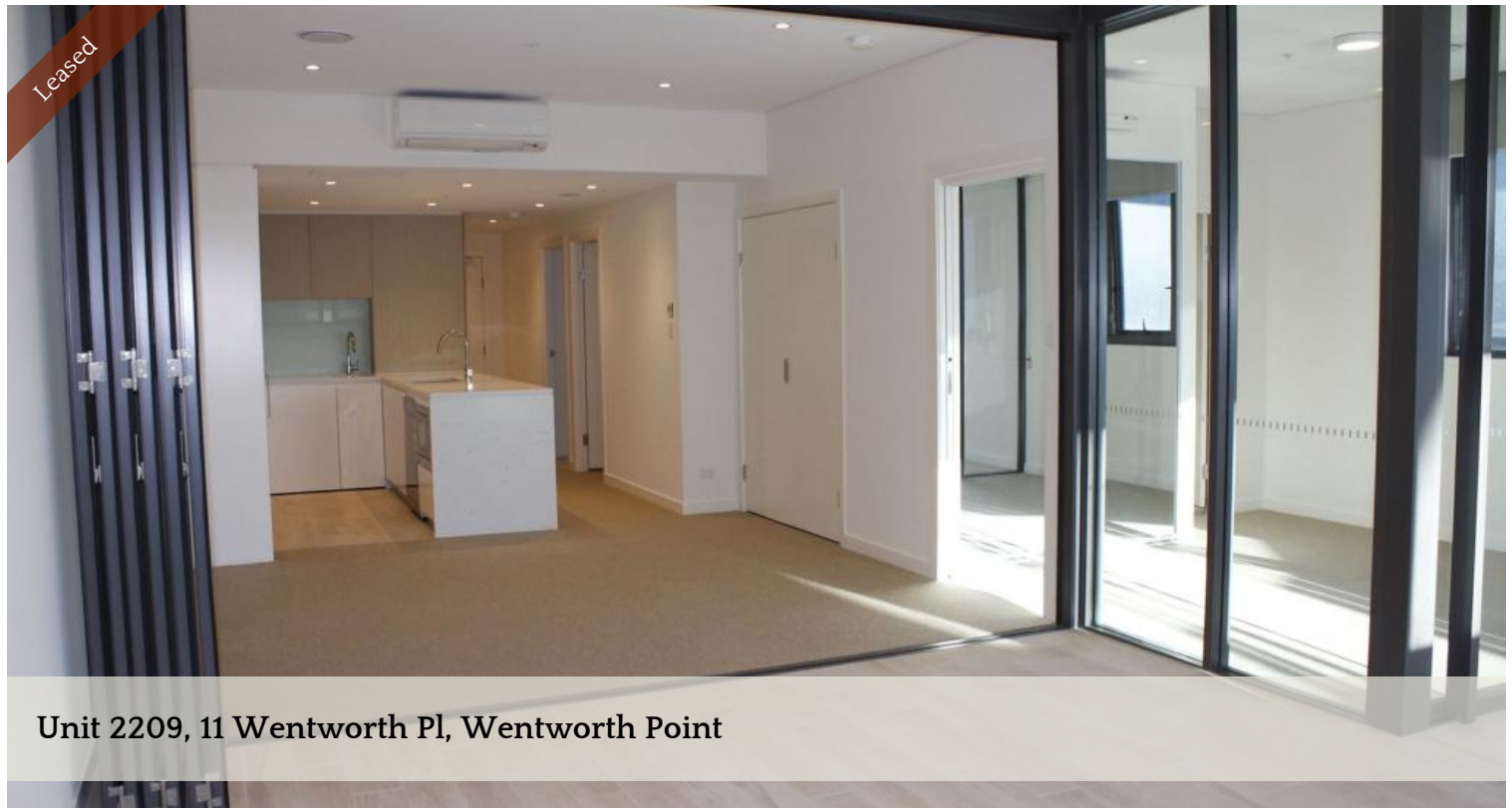
Unit 2209, 11 Wentworth Pl, Wentworth Point