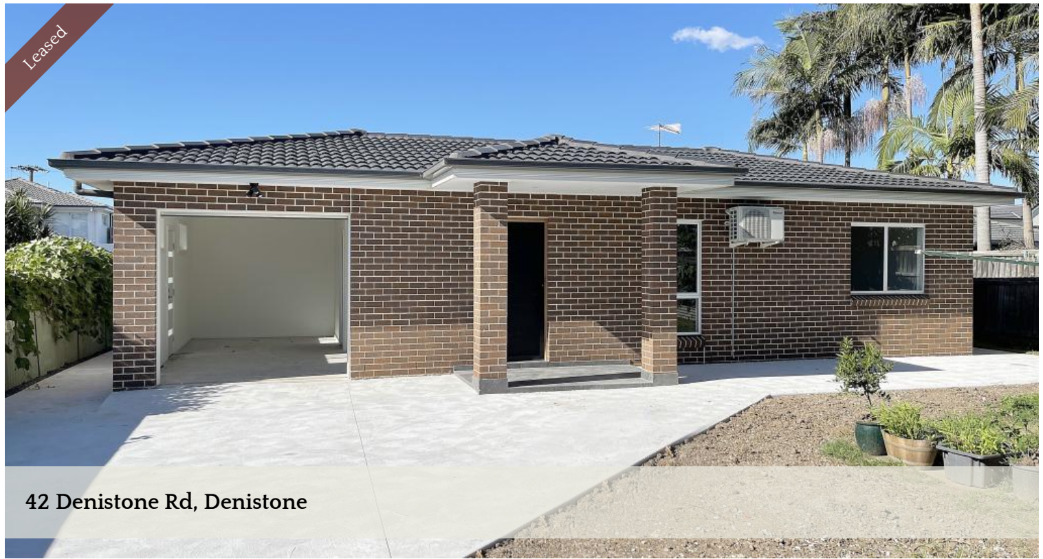
42 Denistone Rd, Denistone