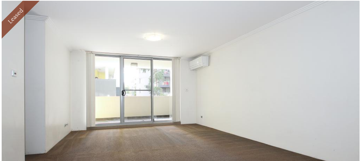
Unit 16, 4 West Tce, Bankstown